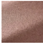
F3445005 Rose ancien