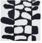
F3485001 Noiret blanc