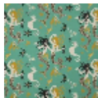
F3536002 Menthe a l'eau