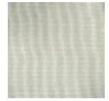
F3543009 Vert d'eau