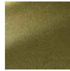
F3756034 At veronese