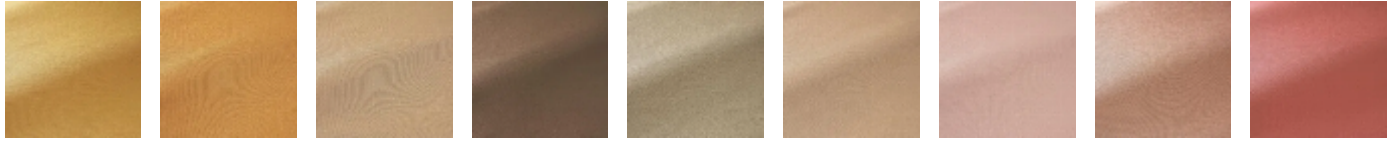
F3756010 Ble F3756011 Ambre F3756012 Sepia F3756013 Chataigne F3756014 Mastic F3756015 Bulle F3756016 Nymphe F3756017 The F3756018 Incarnat