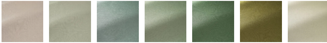
F3756029 Mirage F3756030 Celadon F3756031 Saugue F3756032 Amande F3756033 Meleze F3756034 At veronese F3756035 Tilleul