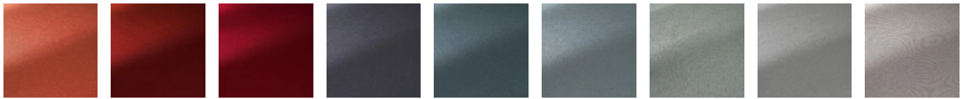
F3756019 Corail F3756020 Cardinal F3756021 Carmin F3756023 Nuit F3756024 Ciel F3756025 Acier F3756026 Horizon F3756027 Fumee F3756028 Mineral