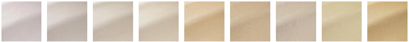
F3756001 Lune F3756002 Perle F3756003 Ivoire F3756004 Lait F3756005 Sable F3756006 Galet F3756007 Grege F3756008 Beurre frais F3756009 Blond