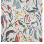
F3787001 Creme 01