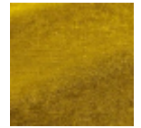
F3793009 Bouton d'or