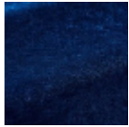
F3793020 Bleu roi