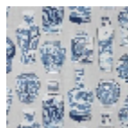
F3806001 Blue porcelain