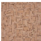
F3815003 Rose des sables