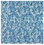
F3829003 Lapis lazuli