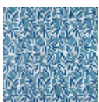
F3829003 Lapis lazuli