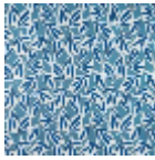
F3829003 Lapis lazuli