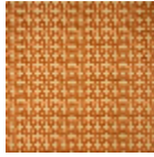
F3833004 Orange brulee