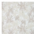
F3837001 Sable blanc