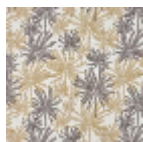
F3837002 Palmier dore