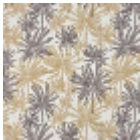
F3837002 Palmier dore