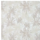
F3837001 Sable blanc