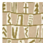
F3856001 qillqay nature