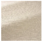
F3865001 E cru