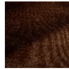
F3871007 Brou de noix