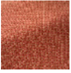
F3982001 PAMPLEMOU SSE