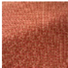
F3982001 PAMPLEMOU SSE