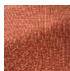
F3982001 PAMPLEMOU SSE