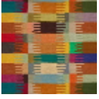
F3995001 MULTICOLOR E