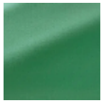
F4019026 MING GREEN