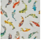
F4021001 MULTICOLOR E