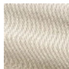
I6517001 Sabbia 01