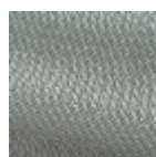
I6517010 Grigio blu 10