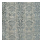
I6526002 Grigio blu