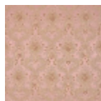
I6624001 001 rialto rosa