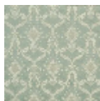
I6624002 002 rialto palazzo