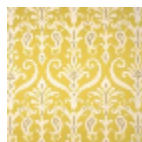
I6627001 Giallo oro