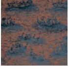
I6628001 Blu reale