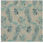
L1688_EGLANT INES_B65_B73 _FM