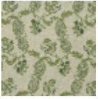
L1688_EGLANT INES_B22_B23 _FA