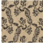
L1688_EGLANT INES_B93_B54 _FB