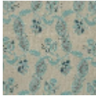
L1688_EGLANT INES_B65_B73 _FM