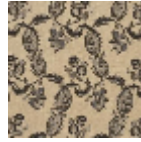
L1688_EGLANT INES_B93_B54 _FB