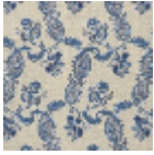
L1688_EGLANT INES_B53_B21_ FE