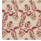
L1688_EGLANT INES_B67_B90 _FE