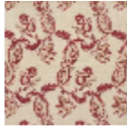
L1688_EGLANT INES_B67_B90 _FE