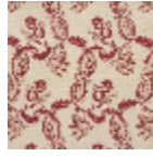
L1688_EGLANT INES_B67_B90 _FE