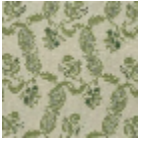
L1688_EGLANT INES_B22_B23 _FA