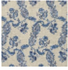
L1688_EGLANT INES_B53_B21_ FE