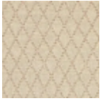
L1893_LOSAN GES_N3022_N 3004_FE