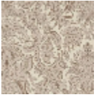
L2018_MURILL O_B26_B04_F E