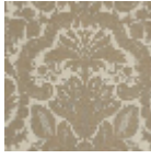
L2018_MURILL O_N3188_N300 3_FE