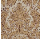
L2018_MURILL O_N3142_N302 4_FC