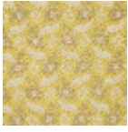
L2141_FEUILLE S_DE_CHENE_ N3010_N3004_ FE