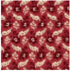
L2141_FEUILLE S_DE_CHENE_ B02_C525_FI