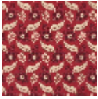
L2141_FEUILLE S_DE_CHENE_ B2_B13_FI