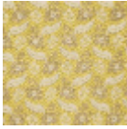
L2141_FEUILLE S_DE_CHENE_ N3010_N3004_ FE