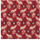
L2141_FEUILLE S_DE_CHENE_ B2_B13_FI