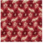
L2141_FEUILLE S_DE_CHENE_ B02_C525_FI