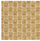
L2407_LES_CH ARDONS_N314 3_FE