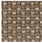
L2407_LES_CH ARDONS_C511_ FE_Verso