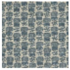
L2407_LES_CH ARDONS_B65_ B39_FE