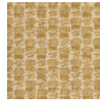
L2407_LES_CH ARDONS_N314 3_FE