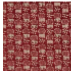
L2407_LES_CH ARDONS_C519 _FM