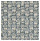
L2407_LES_CH ARDONS_B65_ B39_FE_Verso