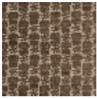
L2407_LES_CH ARDONS_C511_ FE