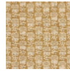
L2407_LES_CH ARDONS_N314 3_FE_Verso