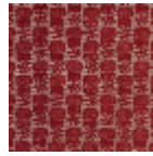
L2407_LES_CH ARDONS_C519 _FM_Verso