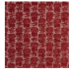
L2407_LES_CH ARDONS_C519 _FM_Verso