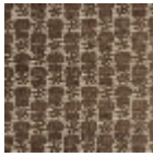
L2407_LES_CH ARDONS_C511_ FE