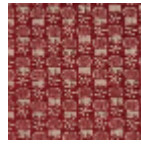
L2407_LES_CH ARDONS_C519 _FM