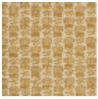
L2407_LES_CH ARDONS_N314 3_FE