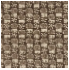
L2407_LES_CH ARDONS_C511_ FE_Verso