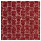
L2407_LES_CH ARDONS_C519 _FM_Verso