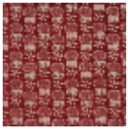
L2407_LES_CH ARDONS_C519 _FM