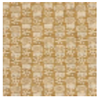
L2407_LES_CH ARDONS_N314 3_FE_Verso