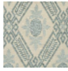
L2924_MURAT _N3016_C537_F E