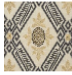
L2924_MURAT _N3142_B93_N 3002_FE