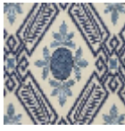
L2924_MURAT _N3011_N3122_ FE