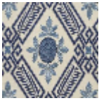
L2924_MURAT _N3011_N3122_ FE