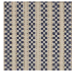
L3077_ALESIA_ N3121_N3013_F G