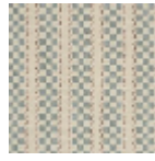
L3077_ALESIA_ N3133_N3013_F E