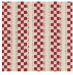
L3077_ALESIA_ N3014_N3015_ FE