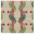
L3101_VICTOR_ HUGO_Bordur es_B02_B22_B 23_N3014_FG