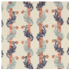
L3101_VICTOR_ HUGO_Bordur es_N3015_N301 6_N3011_N3010 _FE