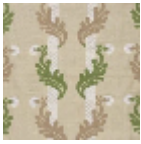
L3101_VICTOR_ HUGO_Bordur es_B88_B24_B 23_B70_FG