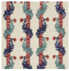
L3101_VICTOR_ HUGO_Bordur es_C520_C535_ C531_C516_FE