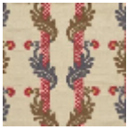
L3101_VICTOR_ HUGO_Bordur es_B02_B93_B 46_B58_FI