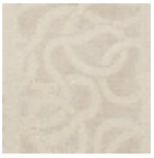
L3117_ENTREL ACS_C501_FE_ VERSO