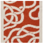
L3117_ENTREL ACS_N3015_FE _VERSO