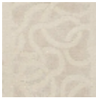
L3117_ENTREL ACS_C501_FE_ VERSO