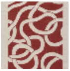
L3117_ENTREL ACS_B41_FE_V ERSO