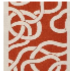
L3117_ENTREL ACS_N3015_FE _VERSO