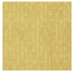
L3294_QUADR ILLE_N3010_FE _VERSO