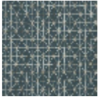
L3294_QUADR ILLE_B65_FE_V ERSO