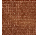
L3294_QUADR ILLE_C517_FG_ VERSO