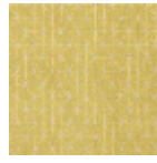
L3294_QUADR ILLE_N3010_FE _VERSO